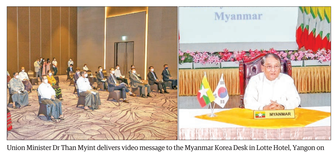
24 December 2020.

UNION Minister for Commerce Dr Than Myint addressed the opening ceremony of Myanmar Korea Desk held in Lotte Hotel, Yangon, through a video message