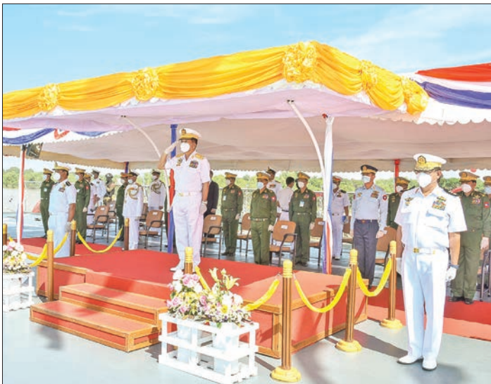
Commander-in-Chief of Defence Services Senior General Min Aung Hlaing attends the commissioning ceremony of naval vessels at the No 3 Naval Jetty in Yangon to mark the 73rd Anniversary of Tatmadaw Navy on 24 December 2020.