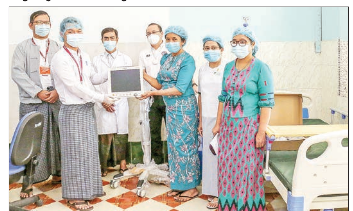
Ayeyarwady Foundation donates COVID-19 medical supplies for hospitals in Ayeyawady Region.

AYEYARWADY Foundation donated COVID-19 medical supplies including one oxygen plant worth K350 million in total for the district/township hospitals in Ayeyawady Region on 23 and 24 December.