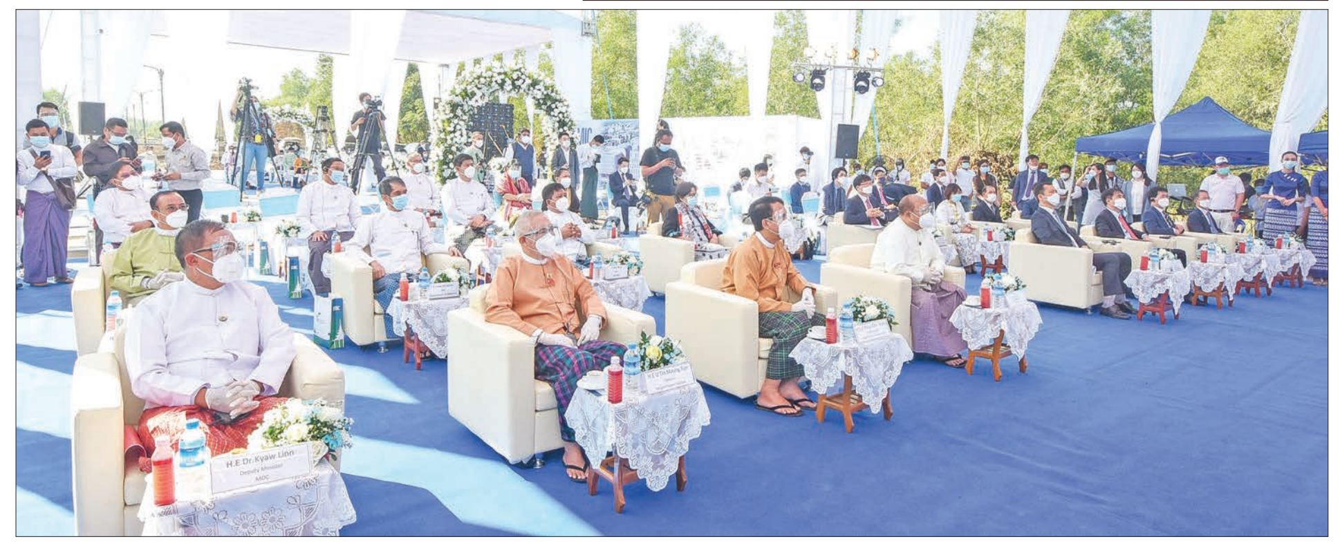
State Counsellor Daw Aung San Suu Kyi delivers the video message to the groundbreaking ceremony of Korea-Myanmar Industrial Complex in Hlegu Township, Yangon Region on 24 December 2020.