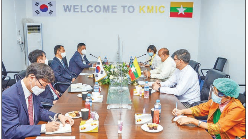
Union Minister U Thaung Tun holds talks with ROK's Chairman of the Presidential Committee on New Southern Policy Mr Park Bok-Yeong on 24 December 2020.

The ceremony was also attended by Speaker U Tin Maung Tun of the Yangon Region Hluttaw, the cabinet ministers of the Yangon Region, Korea Am-